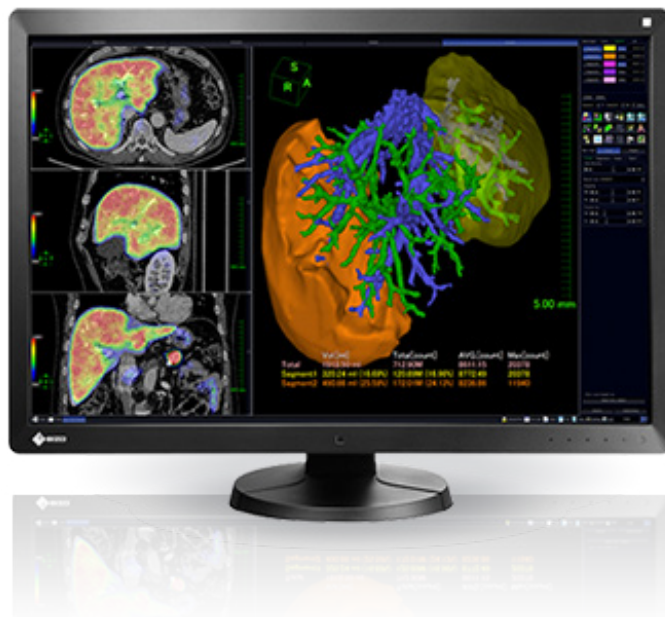
Eizo Radiforce RX650