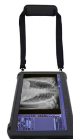
Shown with included shoulder strap