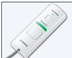
Optional Status Indicator