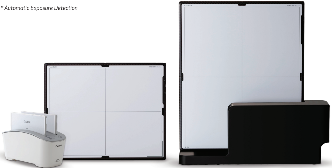
Shown with optional Docking Station, sold separately.